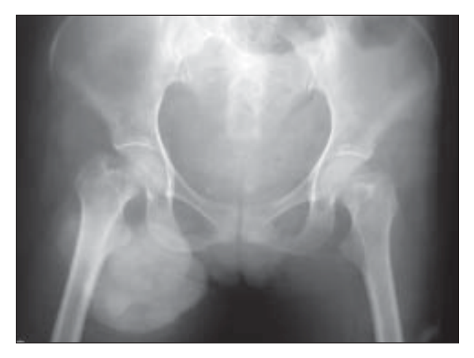
Figure 2:X-ray pelvis shows soft tissue mass over upper end of femur

Biopsy from the tumor showed replacement of the dermis by coalescent nests of malignant melanocytes. The cytoplasm was abundant, granular with no