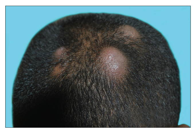
Figure 1: Multiple nodules over scalp with non-scarring alopecia

Histopathology of the skin lesion showed metastatic deposits in the dermis from a high-grade malignant neoplasm with cells of epithelial and spindle cell morphology [Figure 2]. On immunohistochemistry, the cells were positive for cytokeratin and vimentin, and negative for thyroid transcription factor-1 (TTF-1) suggestive of metastasis from sarcomatoid lung carcinoma. Patient was referred to the oncology department where he was treated with cranial irradiation followed