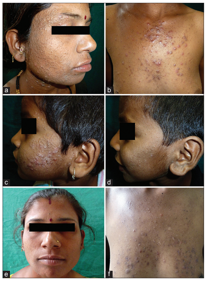
Figure 1: Multiple comedones, inflammatory papules, pustules and occasional cysts over the (a) forehead, lateral side of face, maxillary and mandibular areas imparting a slate gray pigmentation. (b) Chest. Comedones, inflammatory papules and pustules over the lateral face (c) of daughter, (d) son. (e) post treatment residual erythematous macules over face and (f) residual comedones and pustules on the chest of the mother

inhalation or ingestion. Initial erythema is followed within a few days by fine comedones involving almost every follicle imparting a slate-gray appearance affecting predominantly the malar and retroauricular areas and sparsely the chest, trunk and buttocks. [1] Perioral and 'T' area are usually spared. Pale yellow cysts, intermingled with comedones, lessen numerically as the condition extends. In more severe cases, the pustular inflammatory lesions are usually more noticeable on the neck. [3]