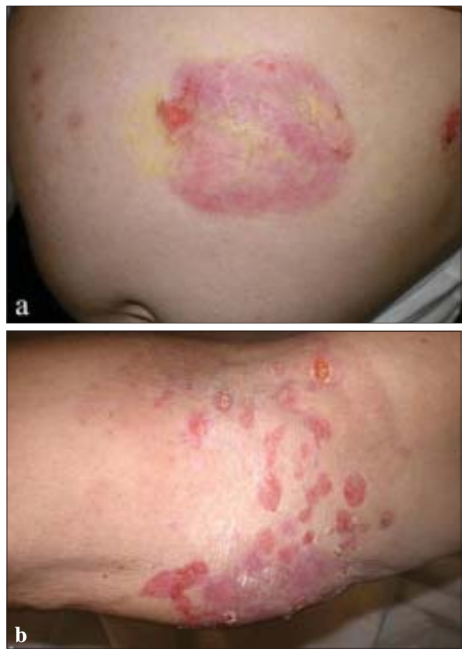
Figure 1: Ruptured bullae on the abdomen (a) and left elbow (b), a few days after the patient had suffered a burn from hot water

zone or circulating IgG autoantibody, respectively. In order to exclude epidermolysis bullosa acquisita one should perform the salt-split skin technique or even electron microscopic examination.