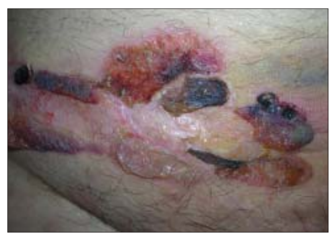
Figure 3: Ruptured hemorrhagic bullae at the site of a postsurgical scar

the trauma and only then it expanded to other areas of the body. As none of our patients had suffered previously from BP this association cannot be called a Koebner phenomenon by definition. Despite the fact that trauma-induced BP is an uncommon condition the clinician should be aware of this possibility and consider the diagnosis of BP in cases of appearance of blisters arising from wounds.