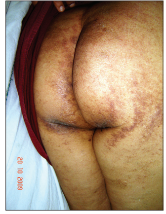
Figure 3: Grandmother: remnant of whorled pigmentation over both the buttocks

Hemogram and routine biochemical tests revealed no abnormalities. Radiological investigations including X-ray, CT scan, and 2D echo detected no congenital anomalies. Histopathological evaluation of the pigmented macules revealed increased pigmentation of the basal cell layer with melanocytes present up to the mid epidermis [Figure 4]. There were focal areas of pigmentary incontinence noticed in the dermis. Genetic studies performed on the peripheral blood from the mother revealed trisomy on chromosome 20, but this study was found to be negative in the child. Fluorescence in situ hybridization (FISH) was advised to rule out similar trisomy in the daughter. Based on clinicopathological correlation, a diagnosis of LWNH was made in all the three family members. The family was reassured of the benign nature of the