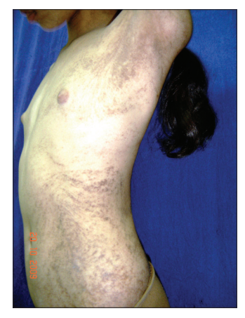
Figure 1: Child: classical whorled, hyperpigmented macules along the lines of Blaschko on the trunk

Mother had similar hyperpigmented macules along the Blaschko's lines, on the flexor and extensor aspects of the right upper limb, both the buttocks and flexor aspect of the right lower limb [Figure 2]. Grandmother had similar lesions on both the buttocks and the right thigh [Figure 3]. There was evidence of partial to complete disappearance of pigmentation along the lines of Blaschko on the extremities and trunk, in both the mother and grandmother. Scalp, face, palms, soles,