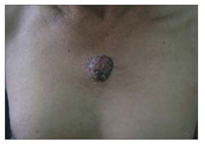
Figure 1: A sessile, brownish tumor with crusts, on the chest