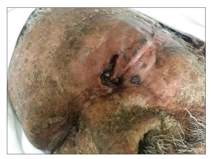
Figure 1: Dermal ophthalmomyiasis, ulcer with maggots present on the left supraorbital area

Gauze pieces soaked with turpentine oil were kept on the ulcers daily followed by mechanical debridement and manual removal of