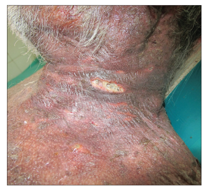
Figure 3: Ulcer with maggots present on neck

Department of Dermatology, Topiwala National Medical College and BYL Nair Hospital, Mumbai, Maharashtra, India