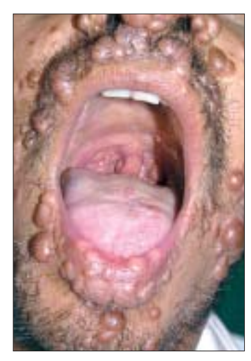
Figure 3: Affection of the lips and oral mucosa

lesion revealed a massive dermal histiocytic infiltration with round cytoplasmic microgranules 1 to 2 microns diameter. The differential diagnosis of lepromatous leprosy was excluded by absence of hypo-aesthesia and negative Z-N stain of scrapped materials from lesions. The diagnosis of diffuse cutaneous leishmaniasis was established. We started ketoconazole 200 mg twice a day and referred the patient to an HIV specialist for antiretroviral therapy and further HIV care. Unfortunately he was lost to follow up after this.