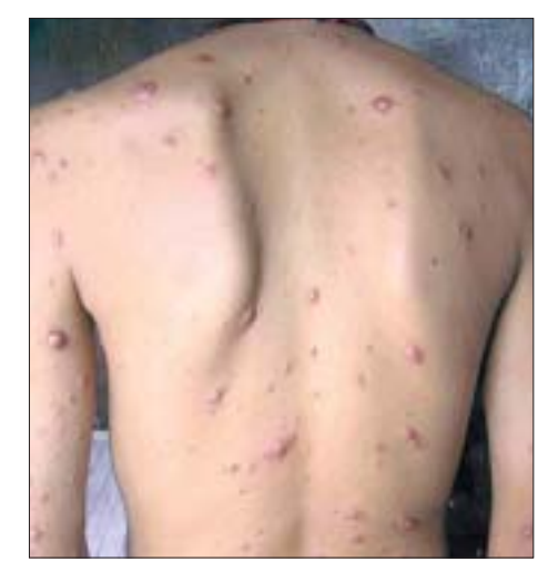
Figure 2: Disseminated papulonodules over the trunk

Leishmaniasis is one of the top five diseases targeted by the WHO Special Program for Research and Training in Tropical Diseases. About 1.5 million new cases are documented each year, and over 350 million people live in areas of active parasite transmission.<sup>[5]</sup>