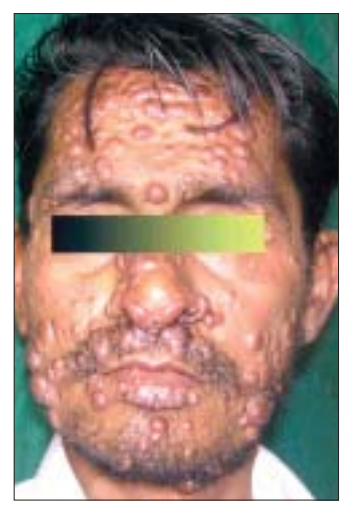
Figure 1: infiltrated papulonodules on the face