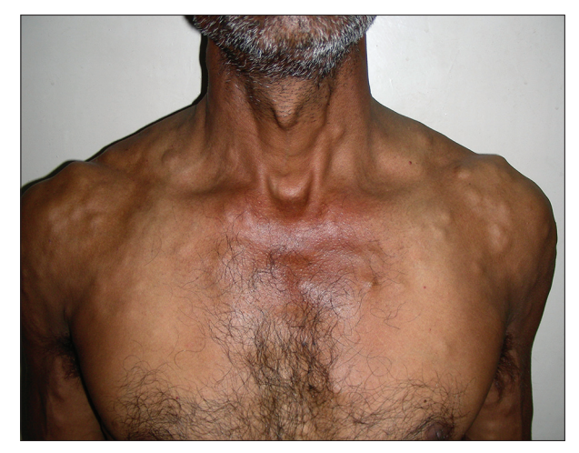
Figure 1: Multiple cutaneous nodules over chest, shoulders, and arms of cutaneous cysticercosis

Human cysticercosis is a major public health problem both in resource-poor as well as developed countries. It is the single most common cause of epilepsy in most of South and Central America, India, South-east Asia, China, and sub-Saharan Africa.[1] It is caused by the dissemination of embryos of T. solium from the intestine via the hepato-portal system to various organs. Humans are the only definitive host of T. solium harboring the adult tapeworm in the intestine. Both humans and pigs are intermediate hosts and harbour T. solium, larvae in different internal organs.[2] These larval stages are rapidly destroyed by the host's immune system in most circumstances, except for those located in immunologically privileged sites like the nervous system. Ingestion of food contaminated with T. solium eggs and faeco-oral auto-transmission in individuals harbouring the intestinal cestode