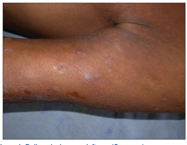
Figure 1: Bullous lesion over left arm (Case one)

In addition, case one had bilateral, tender cervical lymphadenitis (which may be because of type 2 reaction). Slit skin smear and smear from bullous fluid showed acid fast bacilli (AFB) positivity (Bacteriological index or BI = 2 + and 3 + respectively). Direct immunoflurescence (DIF) for autoimmune blistering diseases was negative. Biopsy from bullous lesion showed suprabasal cleavage [Figure 3], diffuse and periappendageal lymphohistiocytic infiltrate in