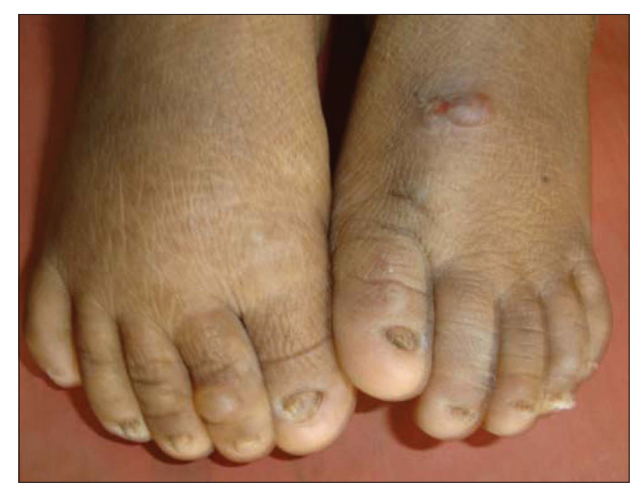
Figure 7: Hypoplastic toe nails with onychodystrophy in epidermolysis bullosa

Onychogryphosis may be seen in patients with ectodermal dysplasias and fucosidosis.