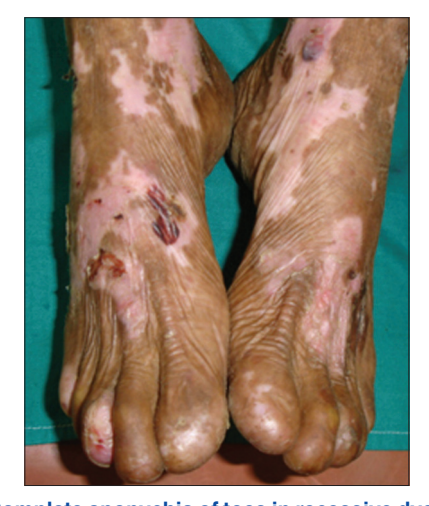
Figure 5: Complete anonychia of toes in recessive dystrophic EB