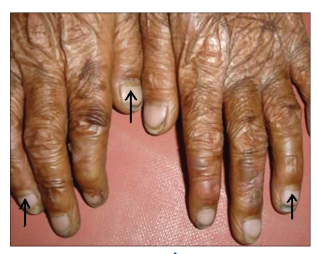
Figure 6: Long and thick cuticles (↑) on several finger nails with parchment-like skin on dorsa of the hands in a boy with Kindler syndrome