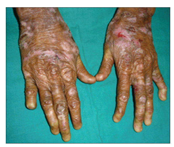
Figure 4: Anonychia of fingers in recessive dystrophic EB