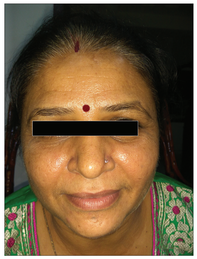
Figure 4: Normal age: 45, drooping and wrinkles score: 25 (36–45 years)

are critical in assessing facial age. Moreover, the scale is difficult to remember for application in day to day clinical practice.