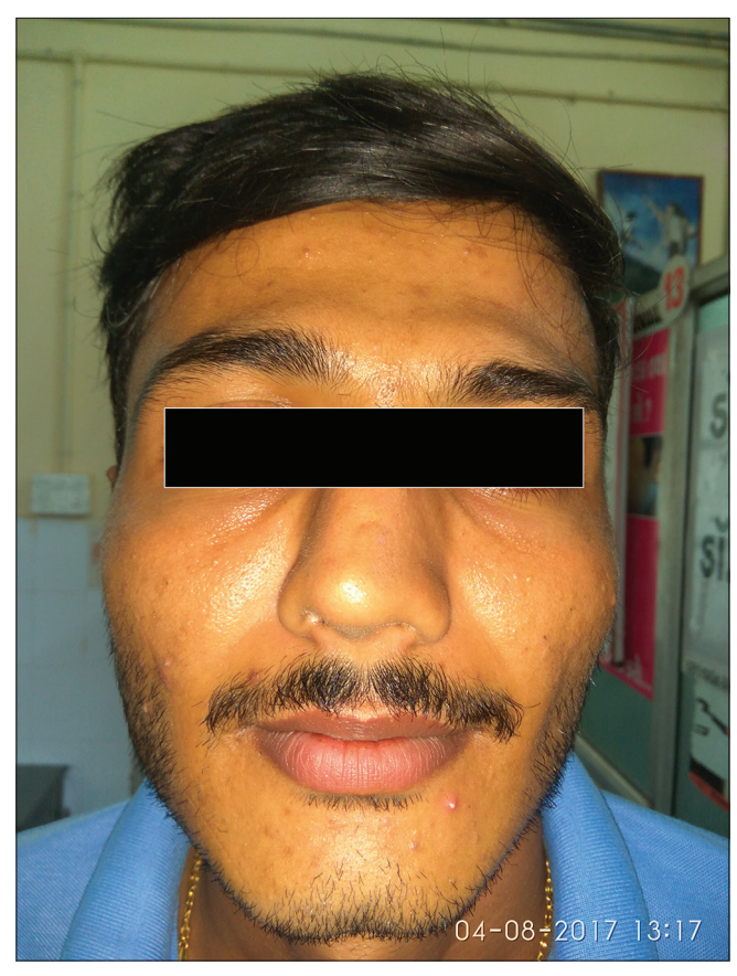
Figure 2: Normal age: 25, drooping and wrinkles score: 19 (36–45 years)

the need and results of various aesthetic interventions. Approaches have been made by many authors to estimate facial age who have developed rating scales based on digital photographs and even confocal microscopy of facial skin.<sup>9</sup> Some researchers devised scales based upon biomarker estimation.<sup>10</sup> However, these are technology driven approaches which are quite sophisticated for use in daily clinical practice and at times are not accurate in estimating visible age.