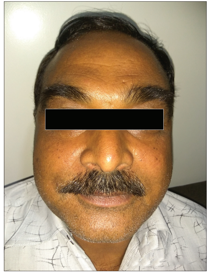
Figure 5: Normal age: 51, drooping and wrinkles score: 27 (46–55 years)

Photoaging is more pronounced on sun exposed areas such as face, neck, volar forearm, dorsum of hand, with elastosis, pigmentation,