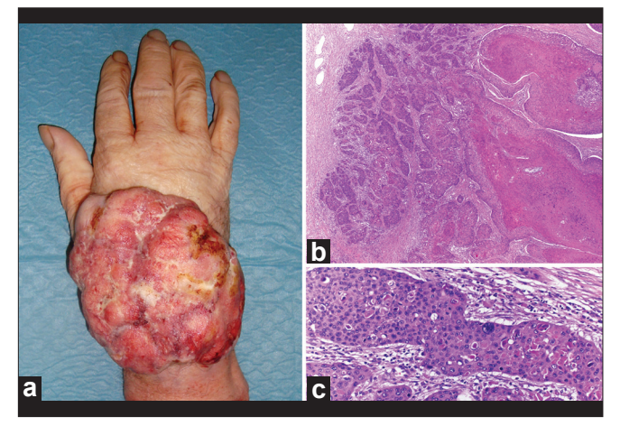
Figure 2: (a) Showing exophytic, ulcerative tumor (14 \times 9 \text{ cm}^2) in the back of the hand-arm. (b) The tumor is composed of irregularly shaped lobules of squamous epithelium undergoing an abrupt change into amorphous keratin (H and E, ×20). (c) At higher magnification, the tumor cells showed nuclei with atypia and mitosis (H and E, ×400)

How to cite this article: Aneiros-Fernandez J, Jimenez-Rodriguez JM, Martin A, Arias-Santiago S, Concha A. Giant proliferating trichilemmal malignant tumor. Indian J Dermatol Venereol Leprol 2011;77:730. Received: December, 2010. Accepted: March, 2011. Source of Support: Nil. Conflict of Interest: None declared.