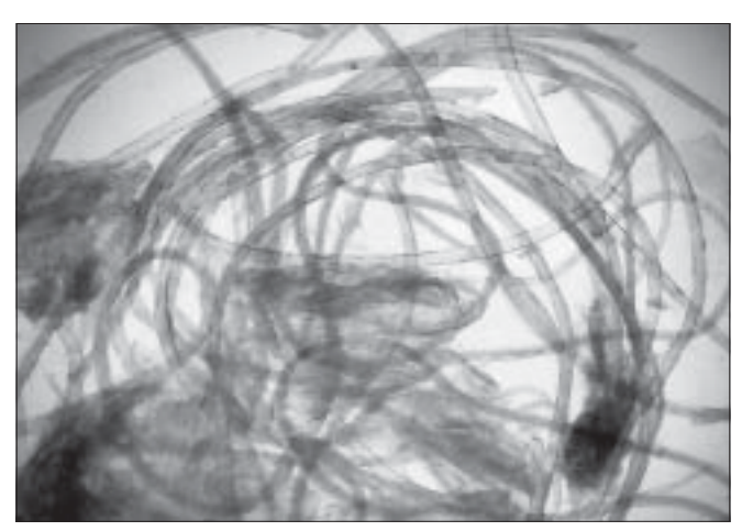
Figure 2: Potassium hydroxide preparation showing numerous vellus hairs in a serpentine array (magnification, X100)