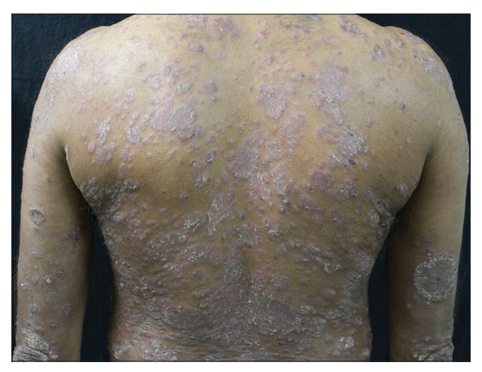
Figure 1: Case 1: Papulosquamous lesions of psoriasis vulgaris

He denied any past history of similar complaints, intake of medications or associated comorbidity apart from his present renal status. He was placed on emollients and topical steroids for psoriasis and on modified Ponticelli regime of alternating months of prednisolone 60 mg and oral cyclophosphamide 50 mg for his renal disease, following which the skin lesions regressed after 8 weeks.<sup>5</sup> However, his renal disease showed only partial remission and he is being followed up. He was also screened similar to the earlier case for secondary membranous glomerulopathy with negative results.