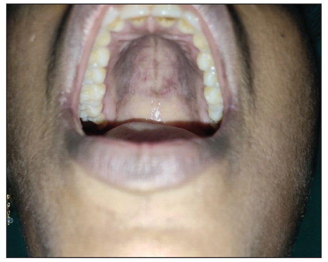
Figure 3c: Post-inflammatory hyperpigmentation on the hard palate

DNA, anti-Smith, anti-histone, anti-U1RNP and anti-PM-Scl antibodies were negative and serum levels of complements (C3 and C4) were normal. Repeat chest X-ray, high-resolution computed tomography thorax and ultrasonogram of abdomen and pelvis were normal. Magnetic resonance imaging of both thighs showed mild oedema and patchy contrast enhancement involving quadriceps femoris muscles, suggestive of myositis. Myositis profile was positive for anti-Mi-2-alpha antibody. A comprehensive evaluation did not reveal any underlying malignancy. Considering the heliotrope rash, symmetrical proximal muscle weakness and elevated muscle enzymes, we made a diagnosis of probable dermatomyositis based on the Bohan and Peter classification. Transaminitis was likely due to myositis, as a part of dermatomyositis. Anti-tuberculosis therapy was withdrawn, and she was treated with dexamethasone four mg twice daily intravenously and hydroxychloroquine 200 mg twice daily per orally. As fever persisted and cutaneous ulcers progressed, she was given methyl prednisolone one gm