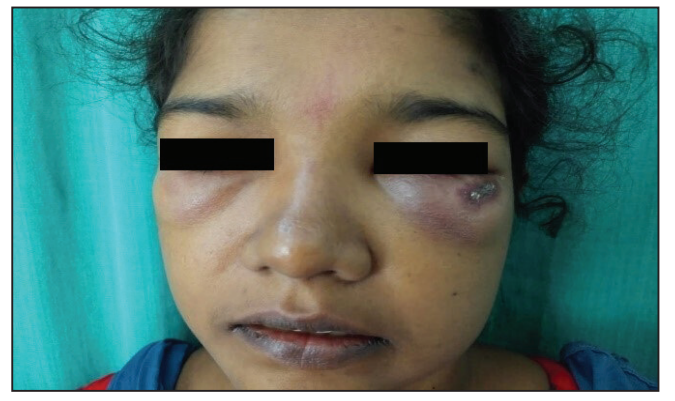
Figure 2a: Bilateral periorbital erythema and oedema with an ulcer on the left infraorbital area