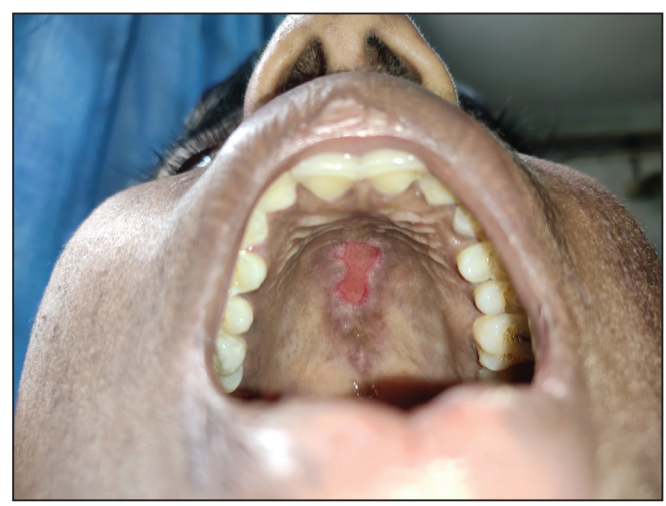
Figure 2d: Erythema and erosion on hard palate