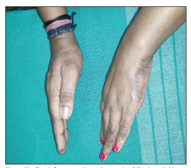
Figure 3b: Post-inflammatory hyperpigmentation following subsidence of cutaneous ulcers on the sides of both hands

DNA, anti-Smith, anti-histone, anti-U1RNP and anti-PM-Scl antibodies were negative and serum levels of complements (C3 and C4) were normal. Repeat chest X-ray, high-resolution computed tomography thorax and ultrasonogram of abdomen and pelvis were normal. Magnetic resonance imaging of both thighs showed mild oedema and patchy contrast enhancement involving quadriceps femoris muscles, suggestive of myositis. Myositis profile was positive for anti-Mi-2-alpha antibody. A comprehensive evaluation did not reveal any underlying malignancy. Considering the heliotrope rash, symmetrical proximal muscle weakness and elevated muscle enzymes, we made a diagnosis of probable dermatomyositis based on the Bohan and Peter classification. Transaminitis was likely due to myositis, as a part of dermatomyositis. Anti-tuberculosis therapy was withdrawn, and she was treated with dexamethasone four mg twice daily intravenously and hydroxychloroquine 200 mg twice daily per orally. As fever persisted and cutaneous ulcers progressed, she was given methyl prednisolone one gm