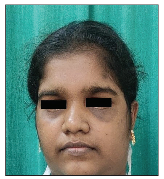
Figure 3a: Bilateral periorbital post-inflammatory hyperpigmentation