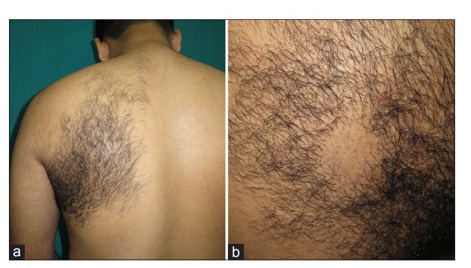
Figure 1: (a) A patch of hypertrichosis over the scapular area (b) Follicular papules which were revealed after shaving

The histopathologic hallmark of smooth muscle hamartoma is an increase of large, randomly oriented bundles of smooth muscle cells with central, cigar-shaped nuclei. These smooth muscle bundles are arranged haphazardly in the dermis.