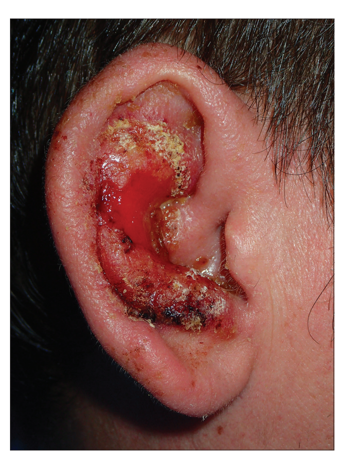
Figure 1a: Erythematous-edematous, ulcerated plaque with superficial desquamation on the right ear