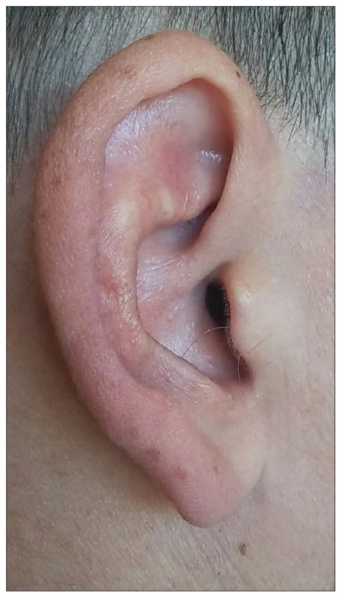
Figure 1b: Complete resolution after the treatment