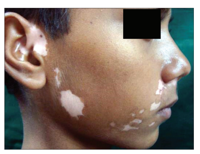
Figure 1b: Clinical pictures of segmental vitiligo as per the experts' opinion as well as the diagnostic criteria: Blaschkoid pattern