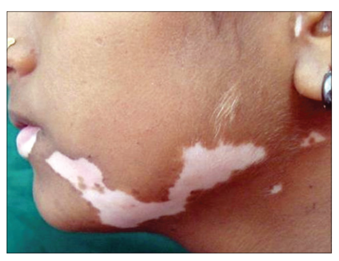
Figure 1a: Clinical pictures of segmental vitiligo as per the experts' opinion as well as the diagnostic criteria: Blaschkoid pattern

There is limited data regarding the characterization of segmental vitiligo based on clinical features in various stages and its differentiation from early nonsegmental vitiligo. To date, there are no well-established clinical criteria for the diagnosis of segmental vitiligo, and a dermatologist's opinion is generally regarded as the "gold standard" in the absence of a validated diagnostic test. <sup>5,6</sup> Based on an earlier