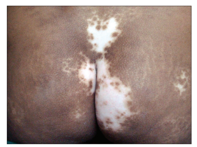
Figure 2a: Clinical pictures of nonsegmental vitiligo as per the experts' opinion as well as the diagnostic criteria

The proposed diagnostic criteria for segmental vitiligo were found to have high sensitivity (91.8%) and specificity (100%) for the cases where the experts were sure of the diagnosis. On including those cases where experts were unsure of their diagnosis but were inclined to make a diagnosis of either segmental or nonsegmental vitiligo, the sensitivity and specificity of the criteria decreased only slightly. We applied the diagnostic criteria even in cases where experts were completely unsure of the diagnosis and could not classify cases as either segmental or nonsegmental vitiligo. Such a situation is not uncommonly encountered in clinical practice and was seen in 30/225 (13.3%) cases in our study. Amongst them, 22 cases were classified as nonsegmental vitiligo and 8