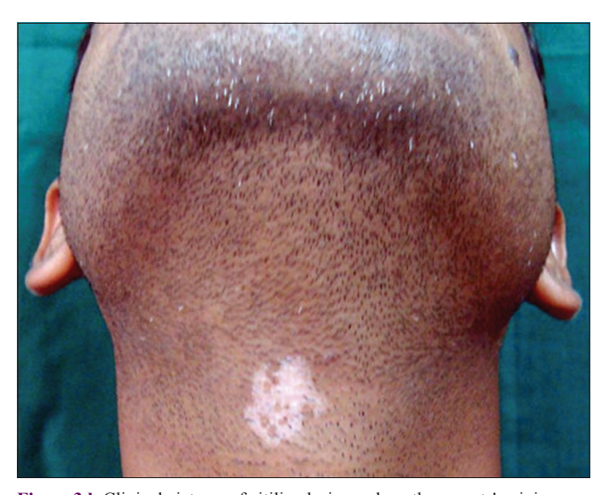
Figure 3d: Clinical pictures of vitiligo lesions where the experts' opinion was "not sure, cannot say", diagnosis as per criteria was "non segmental vitiligo"