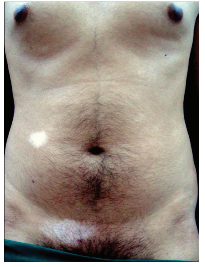
Figure 4b: Disagreement between the experts' opinion and the diagnostic criteria: Expert opinion was 'segmental vitiligo' and by diagnostic criteria was 'non-segmental vitiligo'