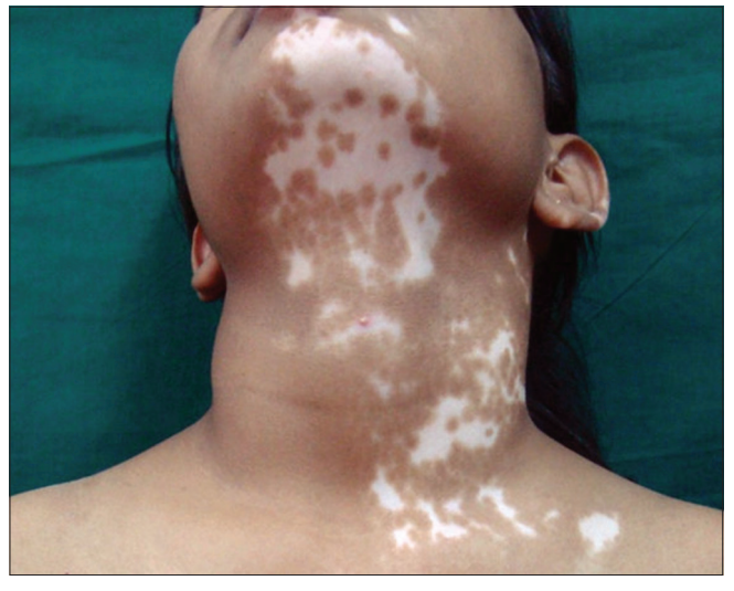
Figure 3c: Clinical pictures of vitiligo lesions where the experts' opinion was "not sure, cannot say", diagnosis as per criteria was "non segmental vitiligo"

Segmental vitiligo often assumes a dermatomal or a quasi-dermatomal pattern, similar to herpes zoster. Even