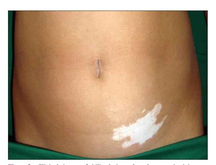
Figure 3a: Clinical pictures of vitiligo lesions where the experts' opinion was "maybe segmental vitiligo", diagnosis as per criteria was "segmental vitiligo"