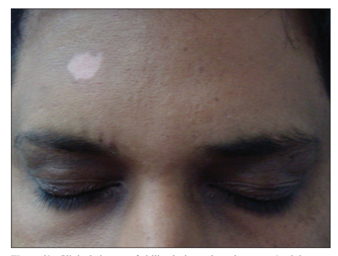
Figure 3b: Clinical pictures of vitiligo lesions where the experts' opinion was "maybe segmental vitiligo", diagnosis as per criteria was "segmental vitiligo"