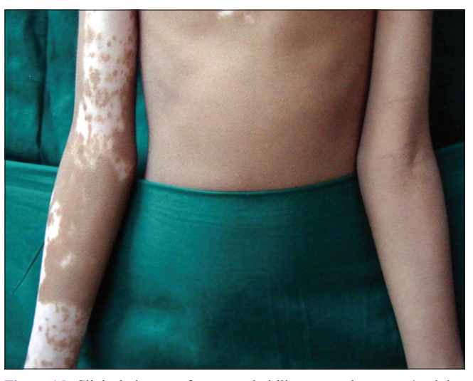
Figure 1d: Clinical pictures of segmental vitiligo as per the experts' opinion as well as the diagnostic criteria: linear pattern