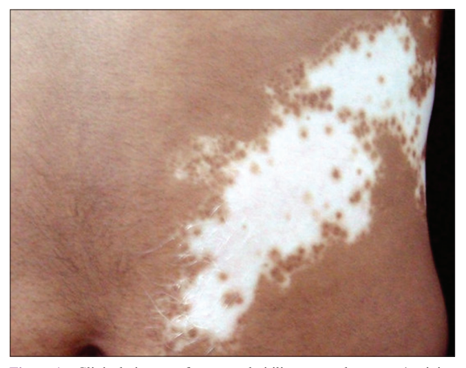
Figure 1c: Clinical pictures of segmental vitiligo as per the experts' opinion as well as the diagnostic criteria: Blaschkoid pattern