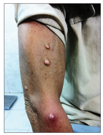
Figure 1: Giant molluscum contagiosum over arm

Investigations revealed a normal hemogram, biochemical, and blood sugar profile. Enzyme-linked