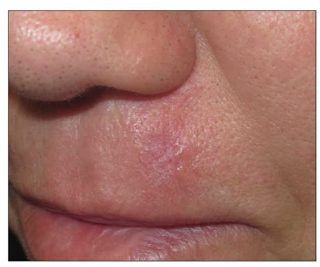
Figure 2: Total resolution of the lesion on the upper lip

Skin nodules with tissue eosinophilia include auto-involutive muco-cutaneous eosinophilic dermatoses, granuloma faciale and erythema elevatum diutinum, angiolymphoid hyperplasia with eosinophilia, Well's syndrome, skin lesions of Churg-Strauss syndrome, Langerhans and non-Langerhans