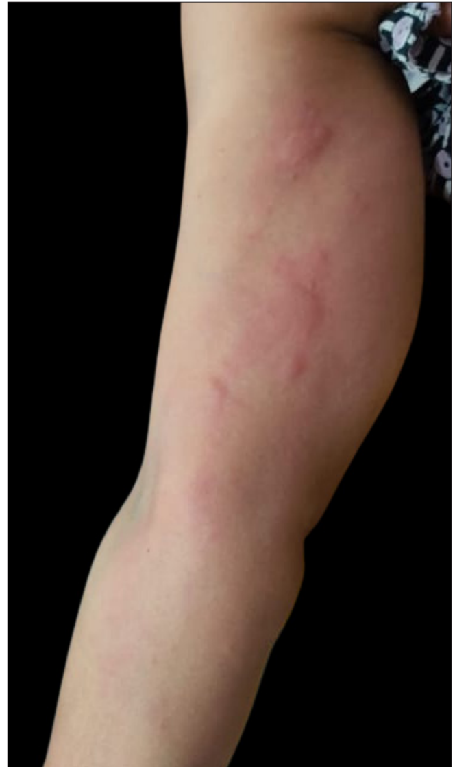
Figure 1b: Photograph shared by the patient, showing frank urticarial wheals over the same site