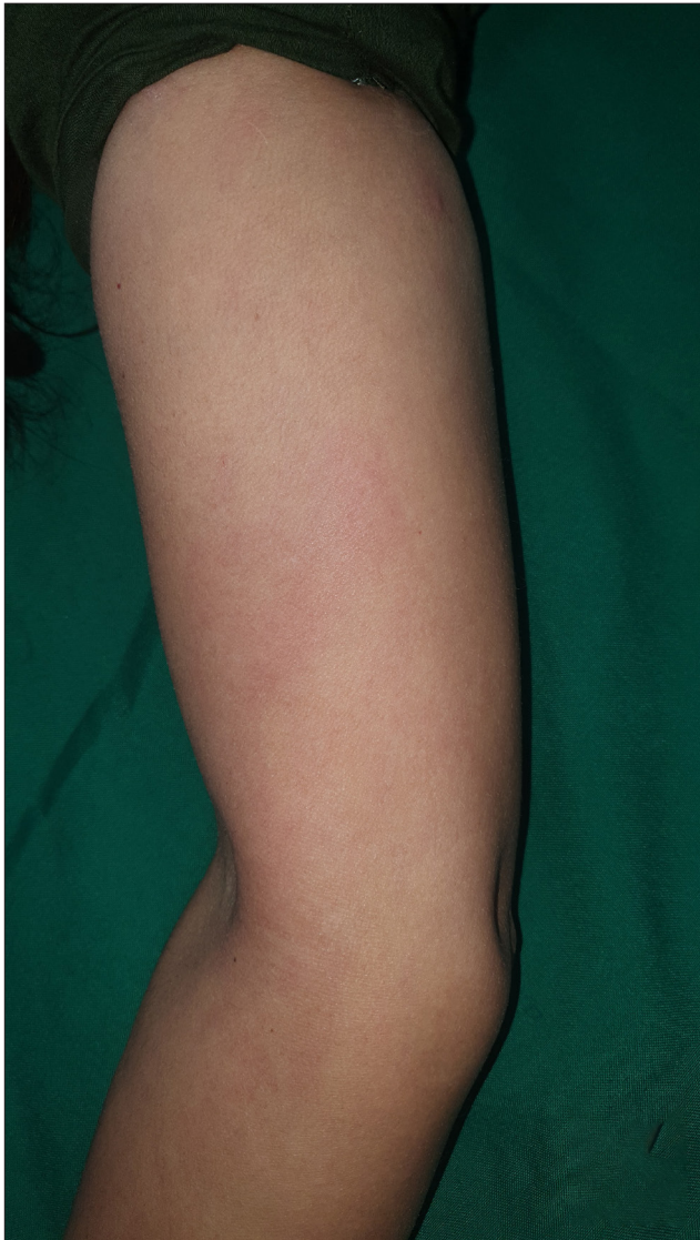
Figure 1a: Subtle urticarial wheal seen over the medial aspect of the right upper limb at presentation