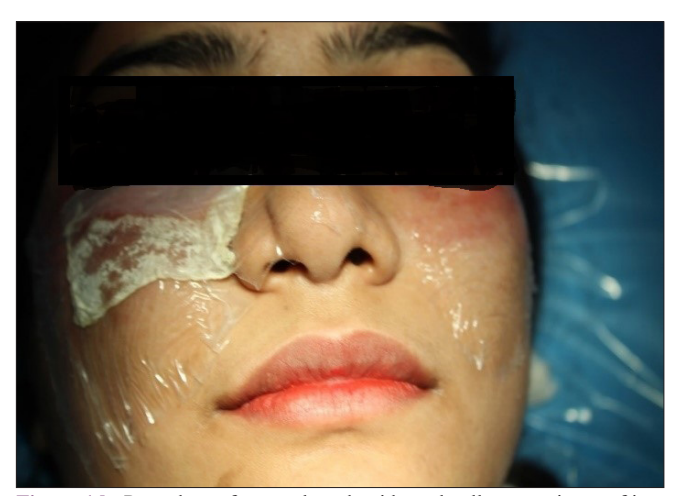
Figure 1d: Procedure of non-cultured epidermal cell suspension grafting: 4-layer dressing after non-cultured epidermal cell suspension grafting