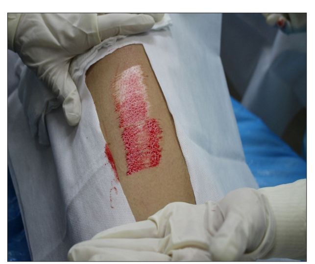
Figure 1a: Procedure of non-cultured epidermal cell suspension grafting: split thickness graft being taken from donor area on thigh

For automated epidermal harvesting system (Cellutome<sup>TM</sup>) [Figure 2a] grafting the harvester blade was positioned at the opposite thigh from where the split-thickness graft was taken [Figure 2b]. The device delivers pressure and warmth with an automated setting to form an array of 128, 2 mm wide microdomes with clear fluid over approximately 30–40 minutes (usually set at 35 minutes and can be increased if microdomes are not properly formed) [Figure 2a and c]. No anaesthesia was used for this technique. The microdomes were captured by a self-adhesive semi-porous dressing [Figure 2d] which formed a transferrable skin micrograft that was immediately applied to the dermabraded recipient site, prepared as above. The self-adhesive dressing was covered with two layers of dressing and left intact for a period of 21 days. Procedures on both the days were carried out on OPD basis such that