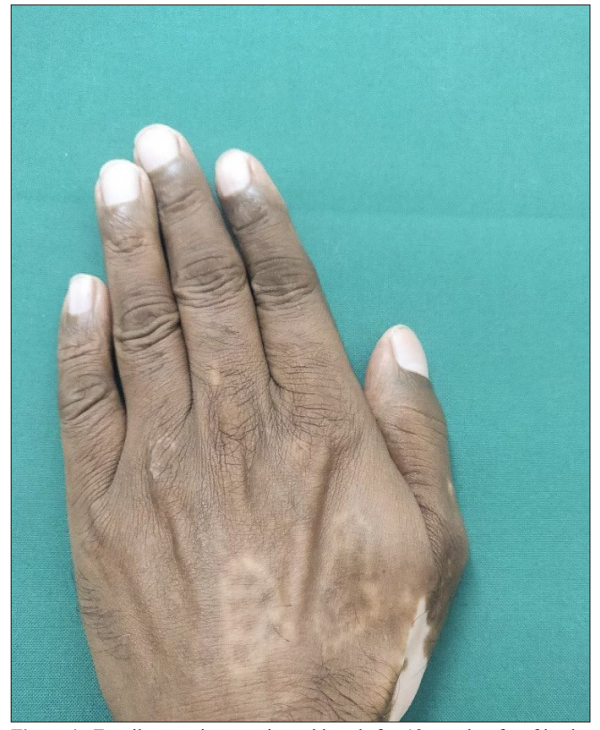
Figure 4: Excellent re-pigmentation achieved after 12 months of grafting by automated epidermal harvesting system technique in Fitzpatrick skin type V