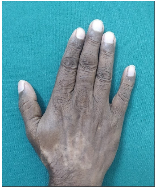
Figure 3: Excellent re-pigmentation achieved after 12 months of grafting by non-cultured epidermal cell suspension technique in Fitzpatrick skin type V