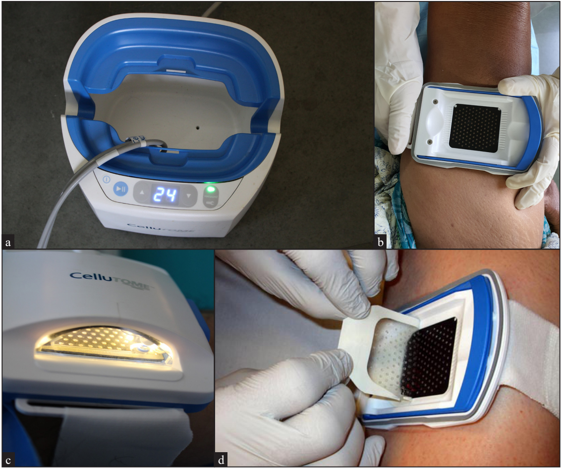
Figure 2a-d: (a) Procedure of automated epidermal harvesting system grafting: timer set on the equipment; (b) Procedure of automated epidermal harvesting system grafting: blade being positioned on donor area of thigh; (c) Procedure of automated epidermal harvesting system grafting: apparatus attached to blade; (d) Procedure of automated epidermal harvesting system grafting: semi-porous dressing containing microdomes being removed from the donor site

and were blinded to which side the two procedures were done (single-blinded) were made to make their assessments while the images were projected. Most of the assessments were same with minimal variation. In case of non-agreement, the lower value was taken.