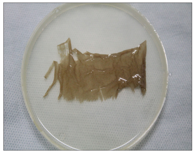
Figure 1b: Procedure of non-cultured epidermal cell suspension grafting: thin split thickness graft

All patients were followed up with narrow band-ultraviolet B phototherapy with the same frequency and duration after removal of dressing on the 21<sup>st</sup> day on both the sites. Serial images were taken pre-procedure, at one month and then at three-monthly intervals for one year with the same camera settings and lighting and were taken by the same person. The response to the therapy was assessed subjectively using the Physician Global Assessment Scale as follows: 75–100% (excellent repigmentation), 50–75% (good repigmentation), 25–50% (moderate repigmentation) and 0–25% (mild repigmentation). All photos were rated together at the end of the study. Assessment was done on digital screen on the same device with the same lighting for all patients. Two independent observers who were not a part of the procedure