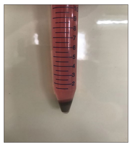
Figure 1c: Procedure of non-cultured epidermal cell suspension grafting: melanocyte pellet after centrifugation

the donor graft for NCES grafting was taken on the first day and the remaining NCES procedure and AEHS grafting were carried out on the second day.