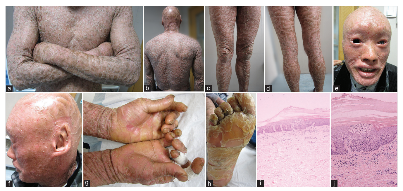
Figure 2: The patient shows (a-d) generalized large gray or brownish lamellar scales (e) alopecia, ectropion, eclabium, teeth abnormalities, corneal opacity of left eye, (f) dysplasia of auricular cartilage, (g, h) palmoplantar hyperkeratosis and deformities of small hand joints, (i) marked hyperkeratosis with a follicular plug, a normal granular layer and acanthosis (H and E, ×20), (j) Infiltration of neutrophils (H and E, ×100)