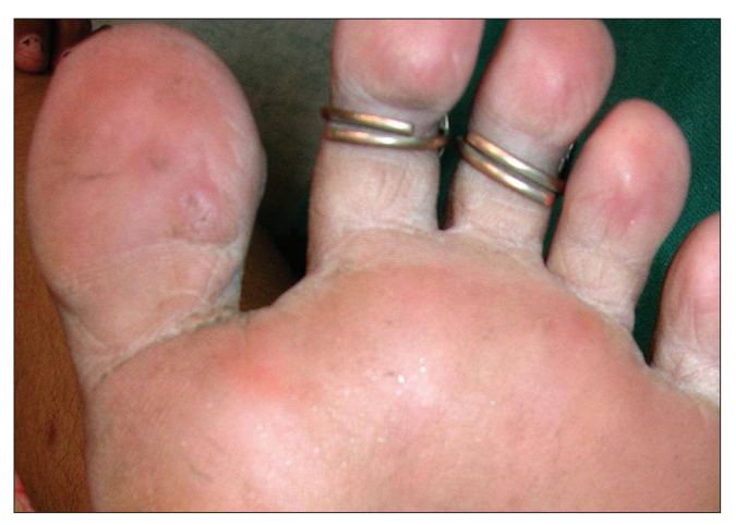
Figure 1: Erythematous nodules over distal plantar aspect of toes

sarcoidosis. Biopsy from the tattoo papule also showed similar dermal infiltrate with presence of macrophages laden with engulfed tattoo pigment, both inside and