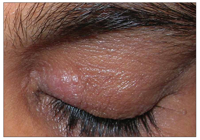
Figure 2: Eyelid papules