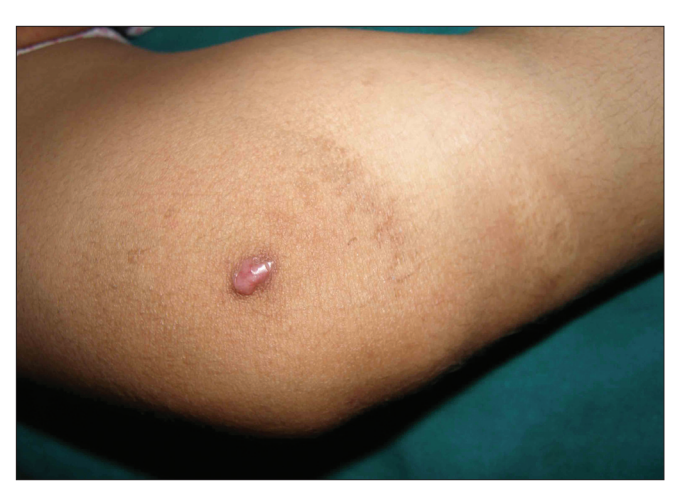
Figure 5: Scar sarcoidosis