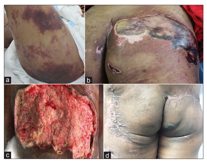
Figure 1: (a) Erythematous tender plaques over the posterior-lateral aspect of left thigh (b) Hemorrhagic infarcts and necrotic eschar with involvement of right gluteal region (c) Healthy granulation tissue post hyperbaric oxygen therapy (d) Healthy scar at 16 weeks post primary closure of wound