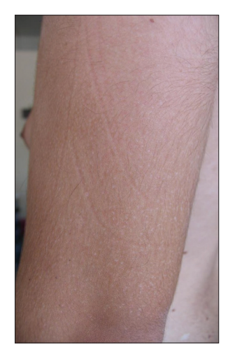
Figure 2: Confetti-like lesions on the left arm of the patient

The diagnosis of complete situs inversus with tuberous sclerosis and polysplenia was made. The patient underwent ophthalmic examination and no retinal lesions, coloboma, angiofibromas of the eyelids or papilledema were found. Neurological examination for sensory and motor function was normal. Psychiatric evaluation was performed, and no cognitive impairment or mental retardation was detected.