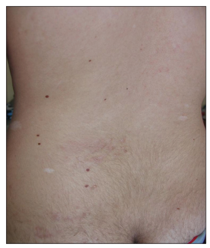
Figure 3: Ash-leaf spots and shagreen patch of the back of the patient.