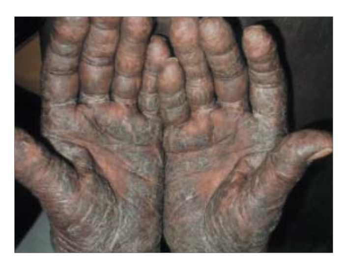
Figure 3: Palmar eczema in chronic actinic dermatitis