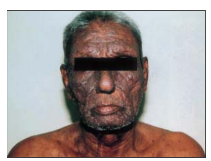
Figure 1: Typical chronic actinic dermatitis facies

Histopathology showed an eczematous picture with spongiosis, acanthosis and a dermal, predominantly perivascular lymphocytic infiltrate and hyperkeratosis in chronic stages. On patch testing, 7 out of 9 patients showed positive reactions to one or more contact allergens [Table 2]. Eight out of 9 patients experienced worsening of the rash on photo-testing. Five tested positive to UVB, 3 to both UVB and UVA. The dosage