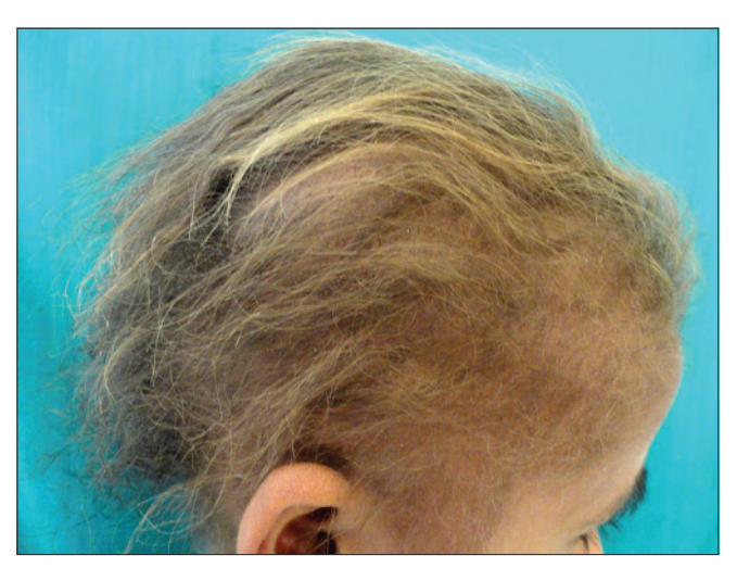
Figure 1: Uncombable hair (side view)

Oral biotin, 5 mg once daily was started. The patient and her parents were counseled about the benign and chronic nature of the condition. The patient is being reviewed regularly.