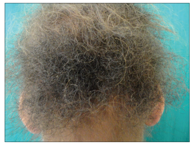
Figure 2: Woolly hair nevus (occipital region)