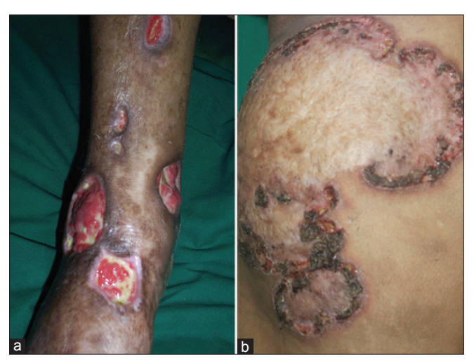
Figure 1: (a and b) Spot the diagnosis.

Rapidly evolving vesicles and bullae with central necrosis and erosion with an areola of erythema