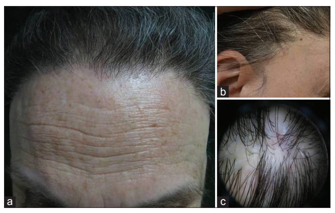
Figure 1: (a) Frontal hair loss with subtle scale of the remaining hairs (b) Temporal hair loss (c) Dermoscopy showed reduced follicular ostia and erythema

To determine if there was any HLA association in this family, similar to that previously reported