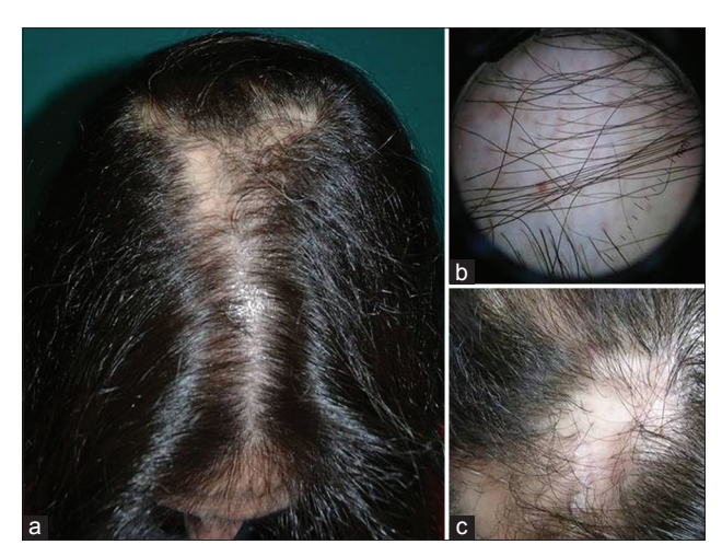
Figure 3:(a) Interparietal patches of alopecia (b) Dermoscopy revealed erythema of the follicular ostia (c) Note the cicatricial aspect of the scalp

in familial lichen planus, HLA studies were performed. Using sequence-specific polymerase chain reaction (PCR) primers, HLA DRB1*04,13 and DQB1*03:02,06 were identified in both the patients. This finding of two first degree relatives with the same HLA type, but different expression of two subtypes of lymphocytic scarring alopecia, is novel.