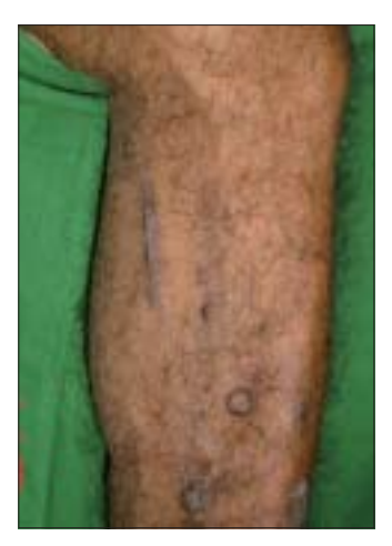
Figure 1: Multiple keratoacanthomas over leg with koebner phenomenon