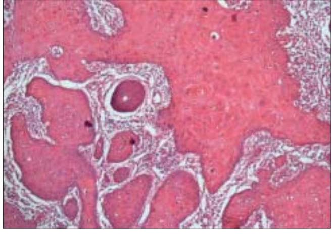
Figure 4: Epidermal proliferation showing glassy cytoplasm (H and E, 100X)

marker was positive in lymphocytes using flow cytometry (conducted at the National Institute of Immunology, New Delhi). The CD4 count was 633 cells/ \mu L, CD8: 1568 cells \mu L, CD<sub>2</sub>: 2271 cells/ \mu L, CD<sub>4</sub>:CD8 = 0.40. Mantoux test was