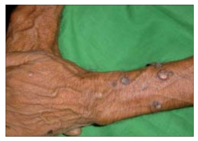
Figure 2: Multiple Keratoacanthomas at the time of admission over forearm and hand