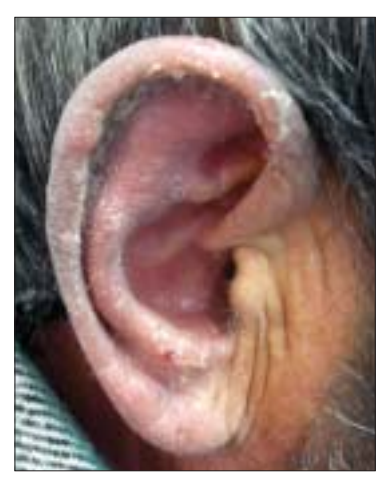
Figure 2: Violaceous scaly lesions over the pinna

Our patient was transferred to Department of maxillofacial surgery for tumor resection.