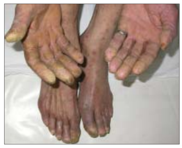
Figure 1: Violaceous scaly lesions involving fingers and toes

Ljubenovic, et al. Acrokeratosis paraneoplastica