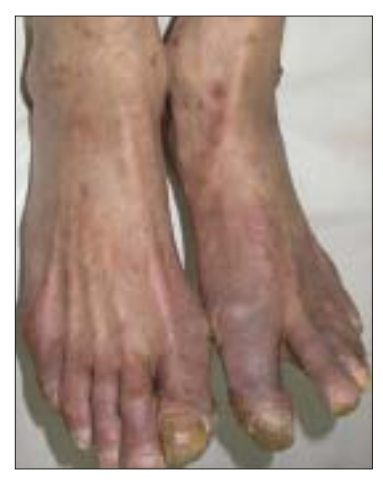
Figure 3: Similar lesions over the toes with nail dystrophy