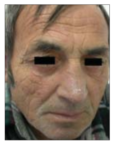
Figure 4: Violaceous scaly tip of the nose

Histopathologic examination showed solid anaplastic metastatic carcinoma with marked desmoplastic reaction. Pathologists mentioned that primary tumor should be searched in thyroid gland, lungs or surrounding tissues. Unfortunately, our patient died before primary tumor was found.