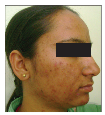
Figure 5: Acne excoriee