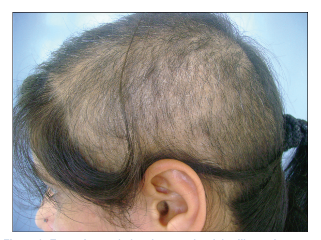
Figure 2: Extensive scalp involvement in trichotillomania