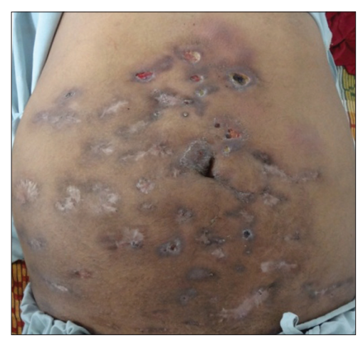
Figure 6: Dermatitis artefacta following subcutaneous injections with pentazocin mimicking atypical mycobacterial infection

be performed to rule out cutaneous and systemic causes of pruritus before diagnosing PP.