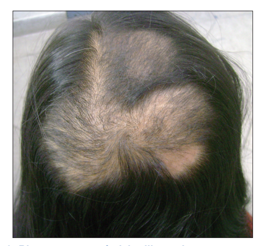
Figure 3: Bizzare pattern of trichotillomania

Brief salient features of other PPsD are summarized in Table 5.