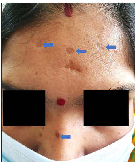
Figure 1: Multiple atrophic hyperpigmented varioliform scars following chickenpox in an adult female (blue arrows).

high fatality rate. It is common to come across survivors with typical varioliform scars on the face. The disease presented with a sudden onset of influenza-like symptoms and a monomorphic rash with centrifugal distribution. Lesions progressed from macules to papules to vesicles to pustules that formed scabs, leaving behind depressed scars [Figure 2]. 4