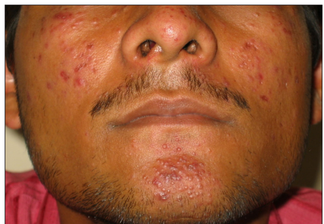
Figure 10: Multiple skin-coloured to erythematous papules with areas of pock-like scarring over the cheeks and chin in an adult male with lupus miliaris disseminatus faciei.

or honeycomb pattern [Figure 9]. 22 The diagnosis is generally clinical. Association with extrahepatic biliary atresia, keratosis pilaris, and pachydermodactyly has been previously reported. 22,23