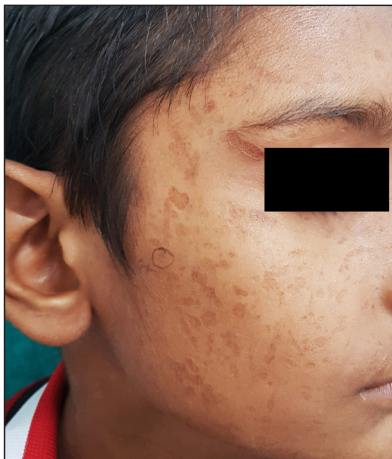
Figure 9: Multiple skin-coloured and hyperpigmented, shallow, punctate, linear and curvilinear atrophic scars of varying sizes in a boy with atrophoderma vermiculatum.