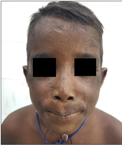
Figure 7: Multiple linear and shallow atrophic scars with waxy induration of skin on the face of a young boy with congenital erythropoietic porphyria.