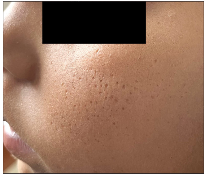
Figure 8: Multiple 1-2mm sized pitted atrophic scars on the cheek of a 6-year-old boy with atrophoderma vermiculatum.