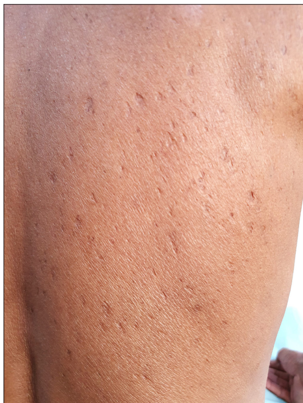
Figure 5: Multiple atrophic varioliform scars on the back after resolution of acne necrotica in an adult male.