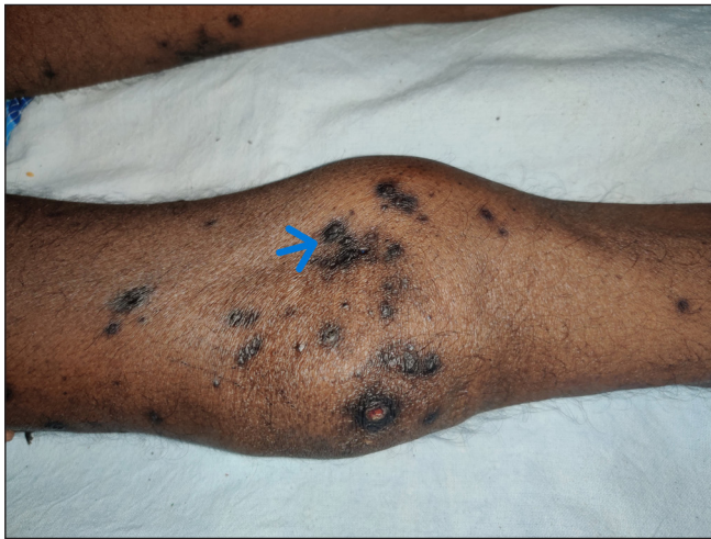
Figure 3: Multiple hyperpigmented papules and nodules with central keratotic plug in a patient with acquired perforating dermatosis secondary to chronic kidney disease. Few scattered atrophic hyperpigmented scars are noted over the right knee (blue arrow).

slightly itchy, self-resolving papulonodular lesions with or without necrosis. The skin lesions tend to involve the trunk and limbs and resolve with atrophic scars. These patients may develop haematological malignancies subsequently. 13