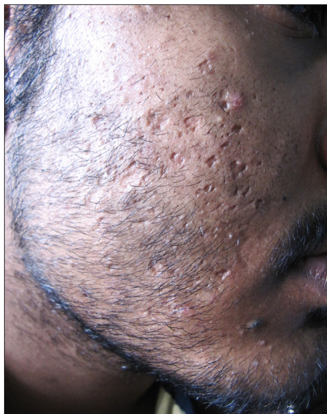
Figure 6: Typical ice pick and boxcar scars of varying sizes and shapes with active acne in an adult male.

progress to form tender papules or plaques with vesicles or haemorrhagic blisters. The lesions become umbilicated with haemorrhagic crusting and heal over several weeks with permanent varioliform scars. The age of development and typical distribution serve as a diagnostic clue. 14