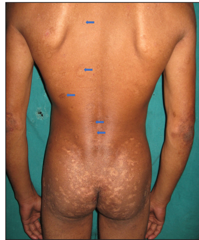
Figure 4: Scattered pock-like scars on the back of an adult male with lipoid proteinosis (arrows).

Otherwise known as ‘malignant atrophic papulosis’ is an occlusive arteriopathy involving small vessels of the dermis and sometimes of the gastrointestinal tract and central nervous system. Characteristic skin lesions are porcelain white papules with central atrophy with a surrounding rim