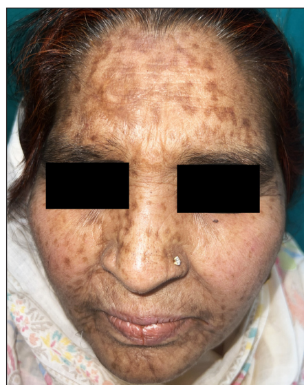
Figure 2: Multiple hyperpigmented depressed scars on the face of a 71-year-old woman who had smallpox at 7 years of age.

RPC is identified by the extrusion of altered collagen through the epidermis. Familial RPC often presents at an early age