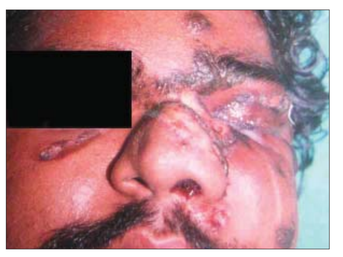
Figure 1: Erythematous plaques with edema and swelling of the left side of the nose and cheek