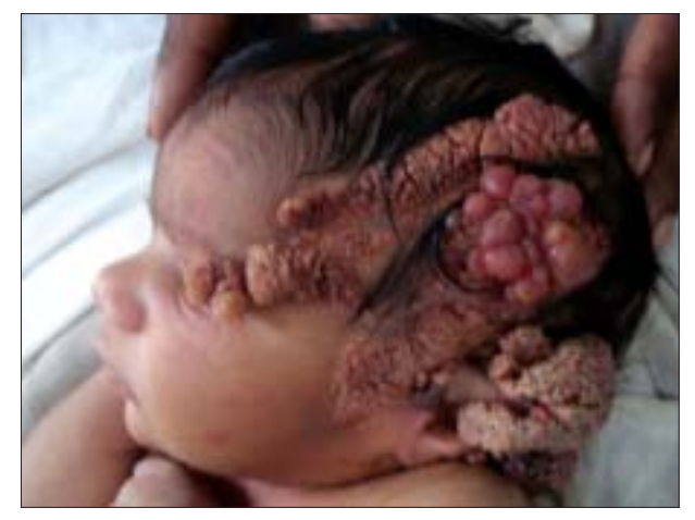
Figure 1: Nevus unius lateralis over the left side of the scalp and face with cystic lesions over the parietal region