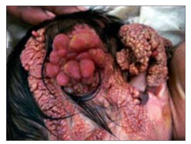
Figure 2: Close-up view of the lesion

hyperkeratosis, acanthosis, papillomatosis, moderate elongation of rete ridges with normal adnexal structures in the dermis [Figure 3]. There was no proliferation of the capillaries in the dermis. The features were consistent with clinical diagnosis of nevus unius lateralis. The other biopsy was taken from the cystic lesion which on histopathological examination revealed slightly less marked acanthosis. There was no proliferation of capillaries in the dermis. Other findings were similar to the findings of the biopsy taken from the vertucous region [Figure 4]. Thus a final diagnosis of nevus unius lateralis was made. The baby was shown to pediatric surgeon, who decided to observe the baby and planned the debulking of the lesion later on when the baby grows up. The baby was brought for follow up after two months. At that time, all the cystic lesions were replaced by more solid, vertucous,