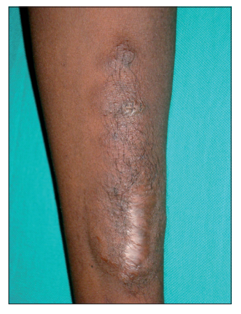
Figure 1: Well-defined, irregular, sessile tumor on the extensor aspect of right forearm

Pacinian neurofibroma (PN) is a rare tumor of neural origin histopathologically characterized by the formation of components resembling Pacinian corpuscles within the lobules of the tumor. [1] It usually occurs as a solitary nodule, most often on the hands and feet, where Pacinian corpuscles are usually concentrated. [2,3] Lesions may occur elsewhere also. [1,2] Diagnosis is established by histopathology features, which may be variable. We report a case of PN which presented as a slowly growing tumor on the forearms. A 17-year-old boy presented with an asymptomatic, well-defined, irregular, sessile, slow-growing tumor [Figure 1] on the extensor aspect of right forearm of