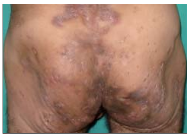
Figure 3: Multiple inflammatory nodules, draining sinuses, polyporous comedones and depressed and keloidal scars over gluteal region

Laboratory analysis revealed leukocytosis (14,000/mm³) with neutrophilia and lymphopenia, moderate anemia (Hemoglobin: 10 g/dL), an elevated ESR (35 mm at the end of one hour) and an elevated C-reactive protein. The patient was found to be diabetic with raised fasting (226 mg/dL) and postprandial (340 mg/dL) blood sugar levels. Urine analysis was normal. Biochemical screening showed no abnormality. Rheumatoid and antinuclear factors as well as HLA-B27 antigen were absent.