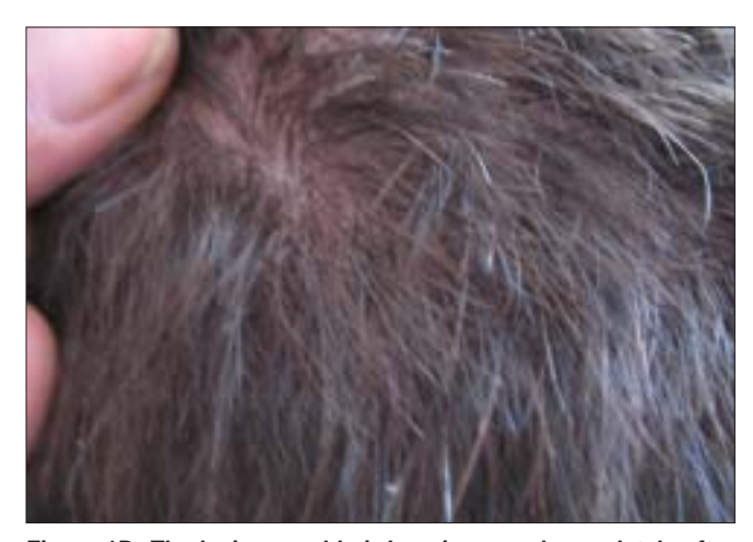
Figure 1D: The lesions and hair loss improved completely after the therapy

lesions, and appear as annular forms. In our case, the patient had rounded plaque-type psoriasis located on the scalp, resembling annular form due to tufting of hairs at the center of the plaque.