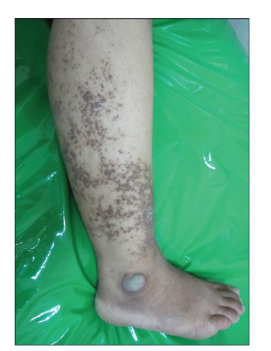
Figure 1: Linear arrange of brown to gray keratotic papules on the right lower leg

Some authors classified ADEN as a separate entity, while many others suggested that ADEN is a variant of segmental (or localized) Darier disease. A review of literature revealed that in most cases, findings such as early onset age of disease, absence of other features of Darier disease, negative family history for Darier disease and lack of seasonal variation, provide clues in favor of ADEN.<sup>[1,2,5]</sup> However,