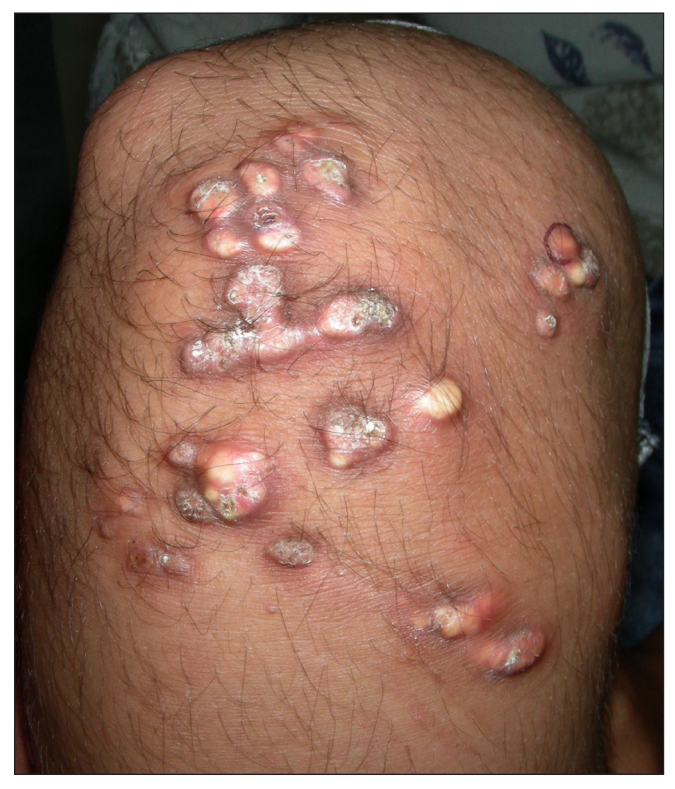
Figure 1: Multiple erythematous and yellow, discrete and coalescent, papules and nodules with central ulceration, white scaling and crusting on the right knee in a 13-year-old girl. Some papules are linearly arranged

Calcinosis cutis is characterised by abnormal deposition of calcium salts in the skin. It is classified into three types based on pathology—dystrophic, metastatic and idiopathic. Dystrophic cutaneous calcification occurs due to the