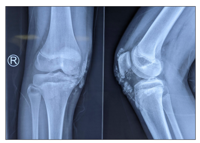
Figure 2b: X-ray of right knee, antero-posterior and lateral view, showing amorphous opacities in the skin and subcutaneous plane suggestive of calcinosis cutis