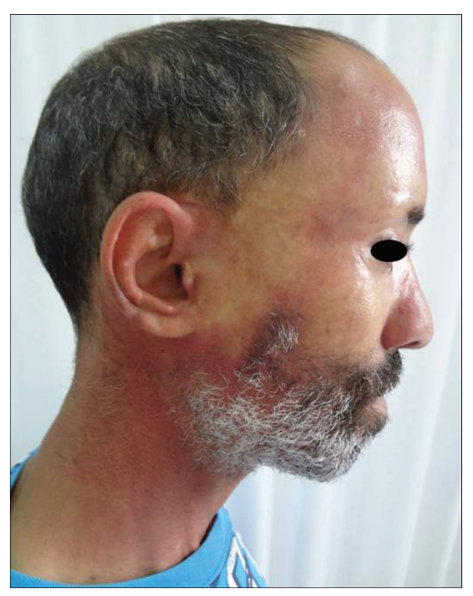
Figure 2b: Sclerosis of the upper face with lower eyelid ectropion, Profile view

Chronic HCV infection has been associated with lichen planus, porphyria cutanea tarda, cutaneous necrotizing vasculitis, erythema nodosum and multiforme, urticaria, morphea and systemic sclerosis.<sup>2,3</sup> In studies reporting the association of viral hepatitis and systemic sclerosis, the role of interferon therapy has been discussed.<sup>2</sup> Only a few cases of a sclerodermatous condition associated with HCV infection have been published.<sup>2,3</sup> As the case presented here is atypical from the classical generalized morphea-like scleroderma associated with exposure to solvents, we suggest that HCV possibly caused the condition. To our knowledge, generalized morphea-like scleroderma associated with HCV infection has not been reported in literature.