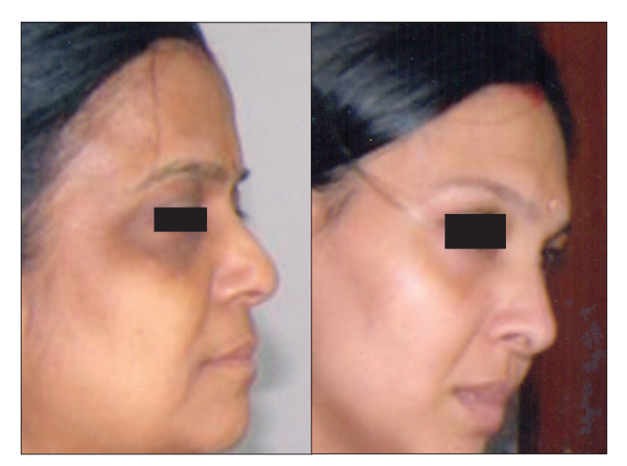
Figure 3: Periorbital melanosis and pigmentary demarcation line over the face in mother and daughter

Periorbital melanosis and PDL-F appeared at the same time in 67 patients while 25 cases were not aware of the presence of PDL-F. The triggering factor was pregnancy in 12 patients; acute illness such as viral hepatitis in 3, typhoid in 2 and chicken pox in one patient. Thirty-six patients had history of POM in one or more of their family members. Periorbital melanosis was associated in 92% of cases with PDL-F. The pattern and extension of POM and PDL-F was similar among the affected family members [Figure 3].