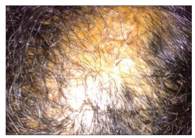
Figure 2: Same patient after 16 weeks of topical minoxidil application

How to cite this article: Tyagi V, Singh PK. A new approach to treating scarring alopecia by hair transplantation and topical minoxidil. Indian J Dermatol Venereol Leprol 2010;76:215.