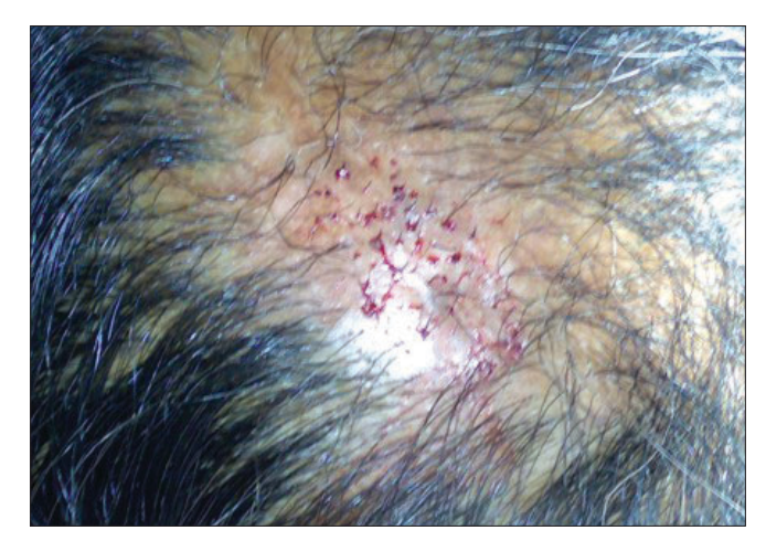
Figure 1: An 18-year-old female patient of CCSA during hair transplantation

All sites accepted the graft successfully. The biggest dimension of repaired alopecia was 240 cm<sup>2</sup> and the smallest was 10 cm<sup>2</sup> [Figures 1, 2]. A maximum graft