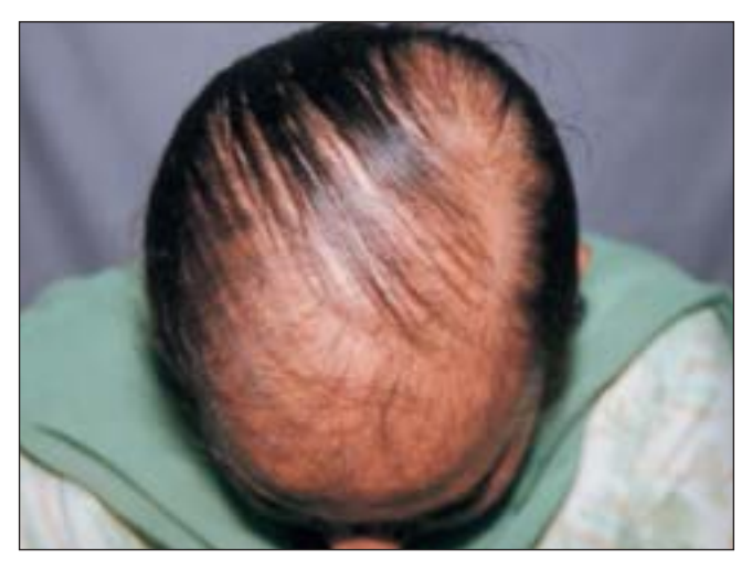
Figure 3: Pre-treatment

The best response was seen on the scalp. The extremities and eyebrows still showed a few remaining areas of hair loss and required further topical treatment with corticosteroids with variable response. The side effects noted were cushingoid facies and weight gain in 2 patients and acneiform eruption in 2