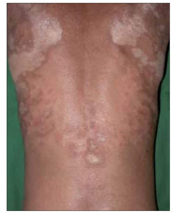
Figure 1: Bilaterally symmetrical erythematous, scaly atrophic plaques of morphea on the back