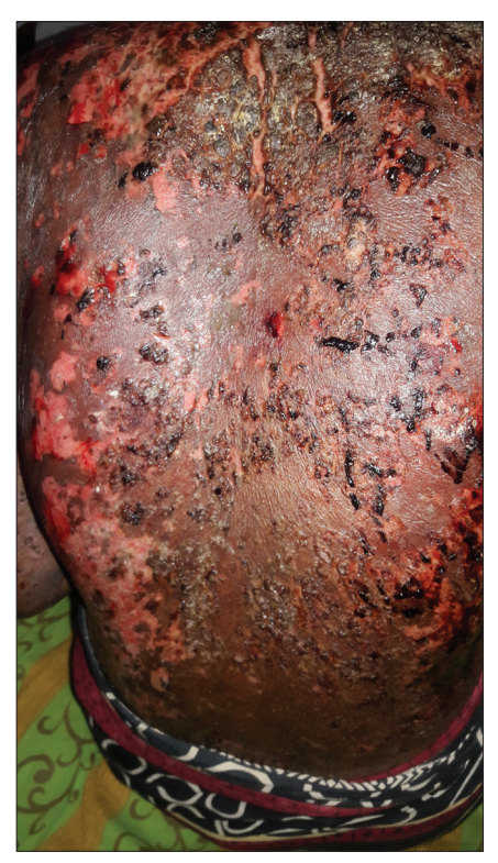
Figure 1: Haemorrhagic crusting with peeling of skin over back in case 1

Eye and genital mucosae examination were unremarkable. There was no history of any drug intake prior to the appearance of lesions. Haematological parameters revealed microcytic anaemia (haemoglobin- 7 gm%) and leucopoenia (total leucocyte count-3,400/cu.mm, normal-4000–11000 per mm³). Anti-nuclear antibodies, anti-SSA/Ro and anti-Smith antibodies were positive. There was hypoalbuminaemia and proteinuria. Skin biopsy revealed a detached epidermis with full-thickness necrosis and dyskeratotic cells, with lymphocytic infiltrate in the upper dermis [Figure 3]. A direct immunofluorescence study showed positive immunoglobulin IgG and IgA deposition along the basement membrane zone in a granular pattern [Figure 4]. Based on clinical, histological and laboratory findings, a diagnosis of systemic