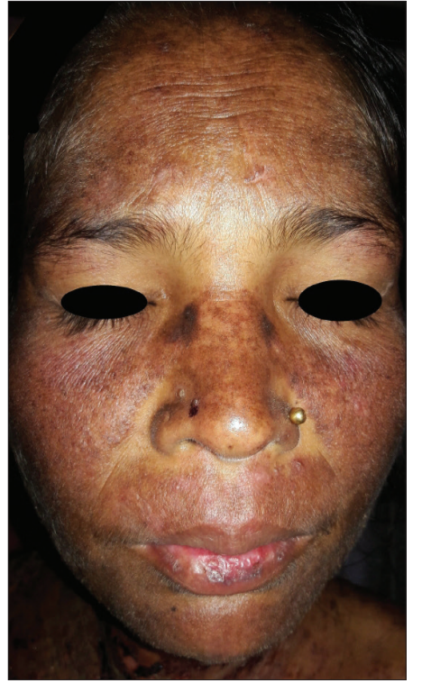
Figure 2: Malar rash with typical sparing of nasolabial fold over the face in case 1

How to cite this article: Mohapatra L, Jain S, Mohanty P, Mohanty J, Mohanty M. Acute syndrome of apoptotic panepidermolysis: Series of three cases. Indian J Dermatol Venereol Leprol 2022;88:873.