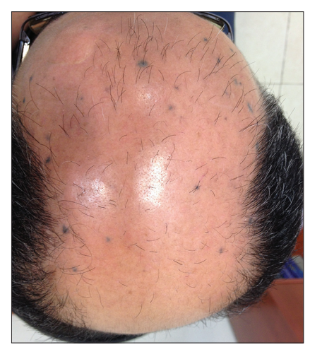
Figure 1: Multiple blue-gray macules on the scalp

There are multiple types of blue nevi, including common blue nevus, cellular blue nevus, malignant blue nevus, large patch/plaque lesions, combined blue nevus, and atypical nevus. [2] Common blue nevi, as found in our patient, usually consist of a single lesion, less than 10 mm in diameter. The common blue nevi can appear anywhere, but approximately half of the reported cases are on the dorsa of the hands and feet. [1] Common blue nevi are also reported to occur in oral mucosa, uterine cervix, vagina, spermatic cord, prostate, and lymph nodes. [1,3] The cellular blue nevus usually presents as nodules or plaques 1–3 + cm in diameter. They can have a smooth or irregular surface, and 50% of cases are found on the sacrum or buttocks [Table 1]. [1] Malignant blue nevi are associated with