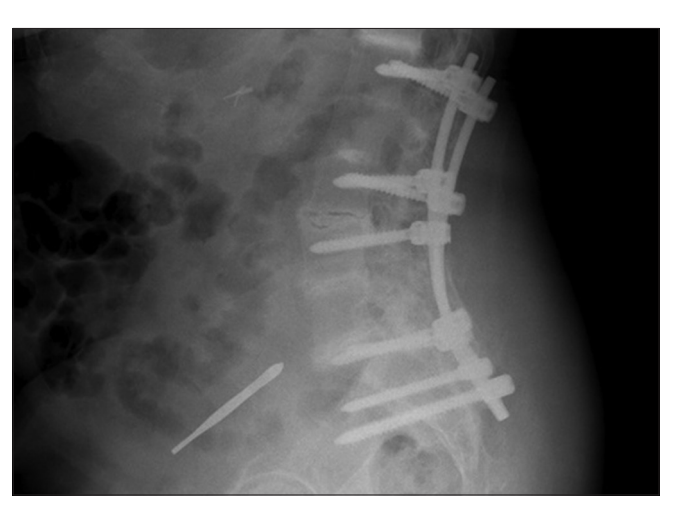
Figure 3: Calcification in the intervertebral disc spaces

The changes induced by alkaptonuria progress slowly but are irreversible and there is no effective treatment. High-dose vitamin C which affects homogenitisic acid metabolism and polymerization in vitro and N-acetyl cysteine and vitamin E, which is also known to affect homogenitisic acid polymerization and accumulation, may be used for treatment. In addition, a low-protein diet that is poor in tyrosine and phenylalanine may be beneficial, particularly in young patients.